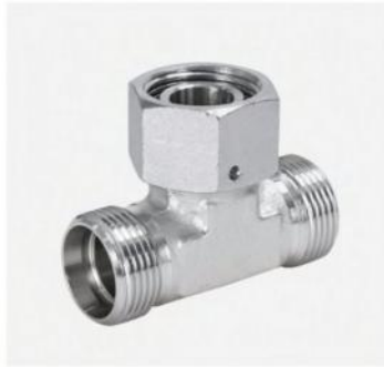
P/N:BC Branch tee fitting with swivel nut