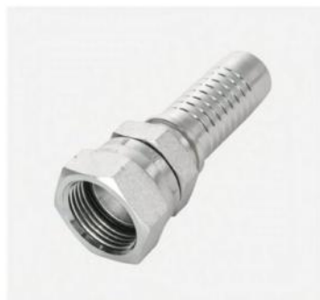
P/N:29611D JIS gas female 60° double hexagon