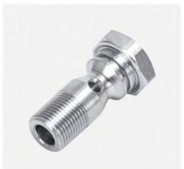
P/N:720B-B Parker standard bolt