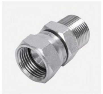
P/N:2NU NPT male / NPSM female 60° cone