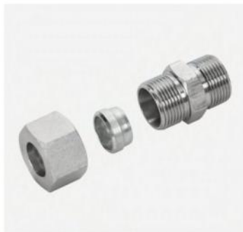
P/N:1C-RN Metric male 24° cone I.t./NPT male with cutting ring and nut