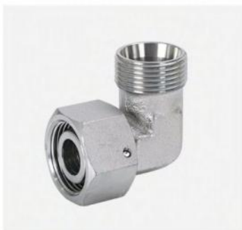
P/N:2C9 90°reducer tube adapter with swivel nut