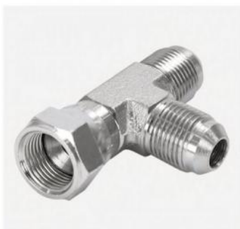
P/N:CJ JIC male 74° cone/JIC female 74° seat run tee