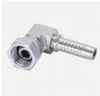
P/N:22691K 90°BSP compact female 60° cone seat sae