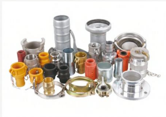
GASOLINE PIPE GUN / PIPE CONNECTOR / VALVES/ CAMLOCK/HOSE CLAMP