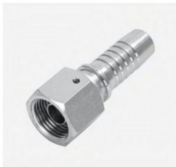
P/N:20411W Metric female 24° cone o-ring L.T thrust-wire-nut