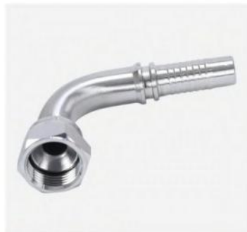
P/N:26791 90°JIC female 74° cone seat sae