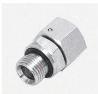
P/N:2BC-WD BSP thread with captive seal/metric female 24° cone o-ring sealing