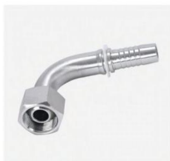
P/N:20191 90°metric female multiseal