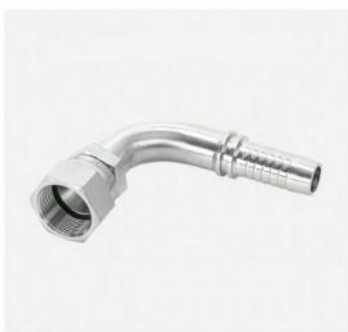
P/N:28691D 90° JIS metric female 60° double hexagon