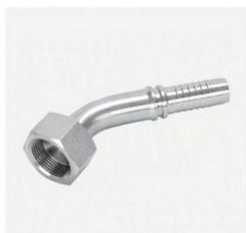
P/N:20741 45°metric female 74° cone seat