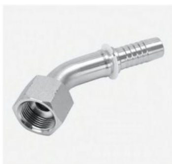
P/N:24241 45°ORFS female flat seat