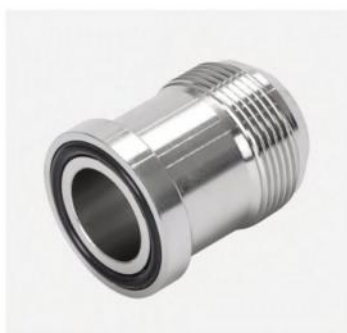
P/N:1JFL JIC male 74° cone /l-series flange