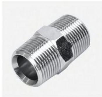
P/N:1N NPT male