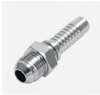
P/N:16711 JIC male