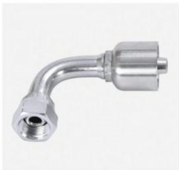
P/N:22691RW 90°BSP female 60° cone one piece