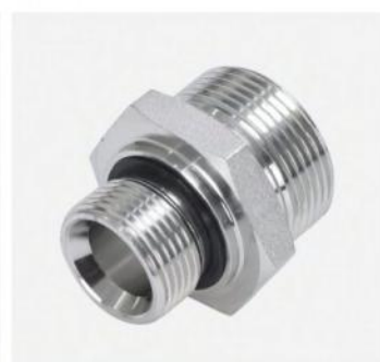
P/N:1CM-WD Metric thread with captive seal