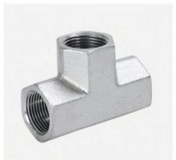
P/N:GN NPT female tee