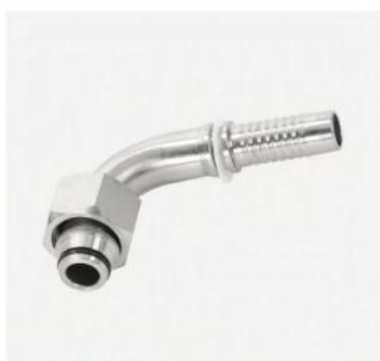
P/N:20491/20591 90°metric female 24° cone o-ring L.T/H.T