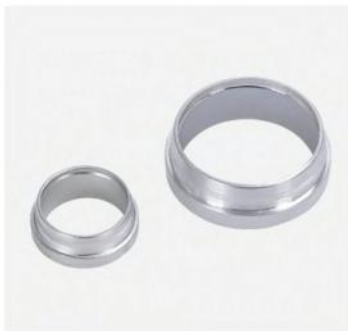
P/N:RL/RS Cutting ring