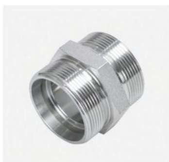
P/N:1C Metric male 24° cone L.T/BSP male with captive seal