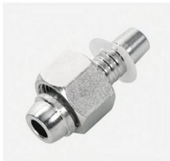
P/N:20411C Metric female 24° cone without o-ring L.T