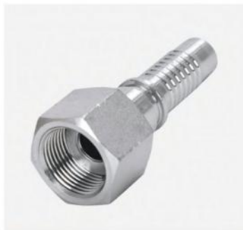
P/N:24211 ORFS female flat seat