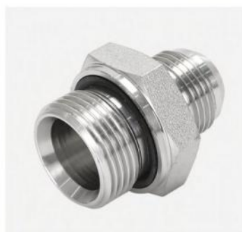
P/N:1JG JIC male 74° cone/BSP male o-ring