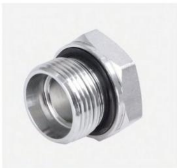
P/N:4C-WD Metric male thread plug with captive seal