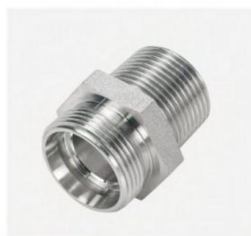
P/N:1CN NPT male /metric male 24° cone I.t