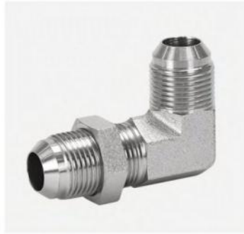
P/N:6J9 JIC female 74° cone bulkhead