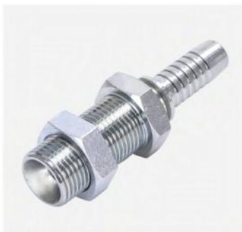
P/N:12611L Customized length BSP male