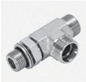
P/N:ACCG-OG BSP thread adjustable stud end with o-ring sealing run tee