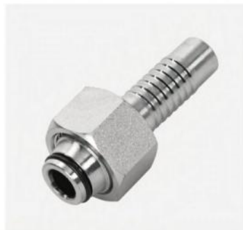
P/N:20411/20511 Metric female 24° cone o-ring L.T/H.T