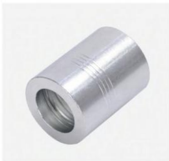
P/N:00400-F Customized ferrule