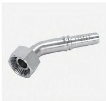
P/N:20441/20541 45°metric female 24° cone o-ring L.T/ H.T