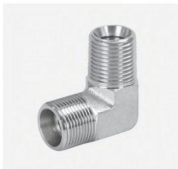
P/N:1CN9 90°NPT male /metric male 24°cone l.t