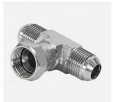
P/N:BJ JIC male 74° cone/JIC female branch tee