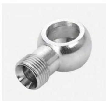
P/N:1CI-B BSP banjo tube fitting