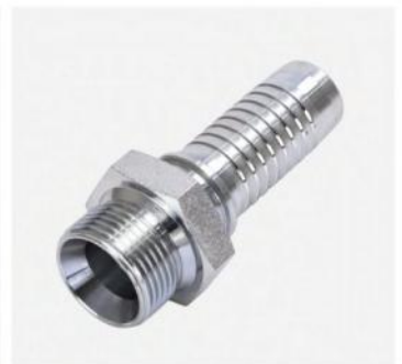
P/N:12611A BSP male double use for 60° cone seat or bonded seal