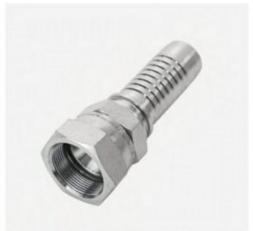
P/N:28611D JIS metric female 60° double hexagon