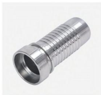
P/N:40011 Welding fitting