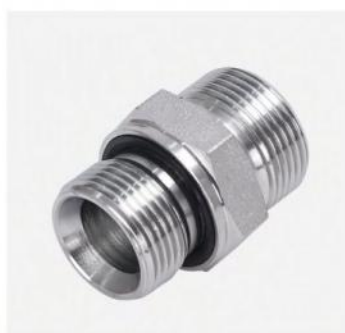
P/N:1CB-WD Metric male 24° cone L.T/BSP male with captive seal