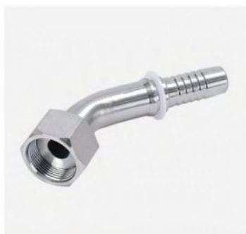
P/N:20241 45°metric female flat seat