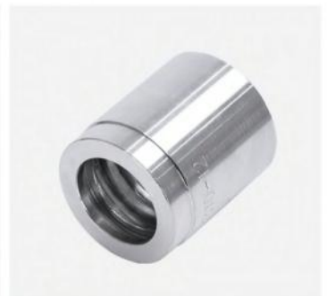
P/N:03310 Ferrule for sae 100r2at/en 853 2sn hose