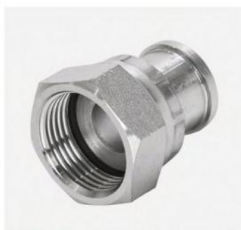
P/N:9F ORFS female plug