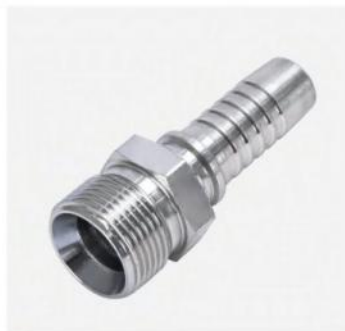
P/N:12611 BSP male