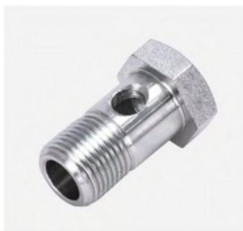
P/N:700M Metric bolt