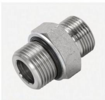
P/N:1FO ORFS male O-ring/SAE O-ring