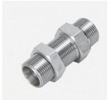
P/N:6C Metric male straight bulkhead fitting