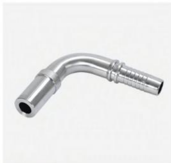
P/N:50091 90°metric standpipe straight