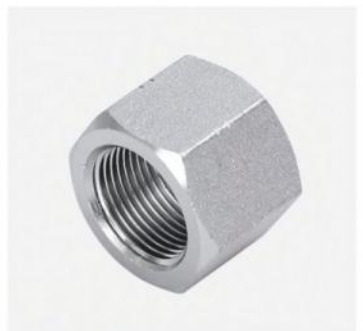
P/N:9N NPT female plug