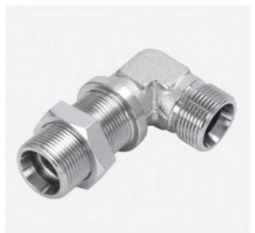
P/N:6C9 90°metric male bulkhead fitting