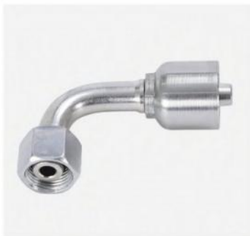
P/N:20491/20591RW 90°metric female 24° cone o-ring L.T/H.T one piece