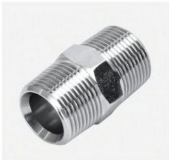
P/N:1T BSPT male