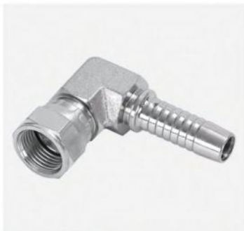
P/N:26791K 90°JIC compact female 74° cone seat sae