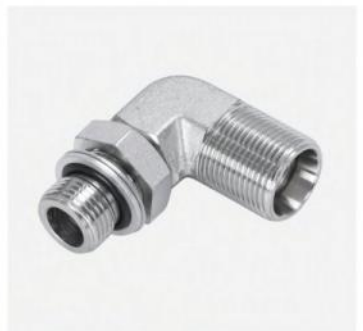
P/N:1CG9-OG 90°BSP thread adjustable stud ends with o-ring sealing