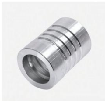
P/N:00621 Interlock ferrule for r13/r15 hose