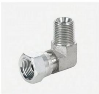
P/N:2NU9 90° NPT male / NPSM female 60° cone