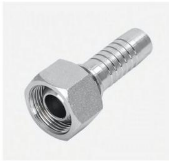
P/N:20111 Metric female multiseal