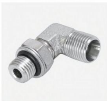
P/N:1CO9-OG UN.UNF thread adjustable stud ends with o-ring sealing