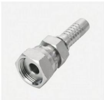
P/N:24211D ORFS female flat seat double hexagon