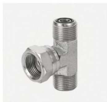
P/N:BF ORFS male o-ring/ORFS female run tee