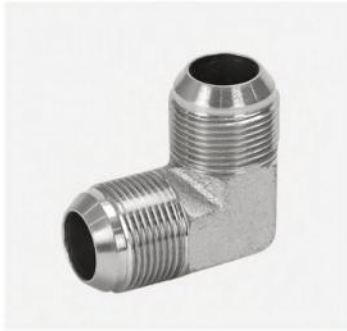
P/N:1J9 90°elbow JIC male 74°cone