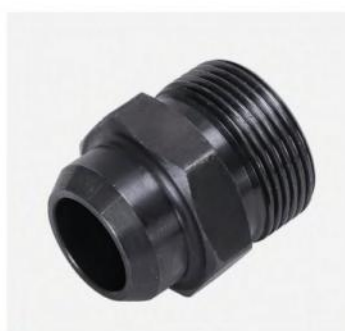
P/N:1CW Metric weld fitting