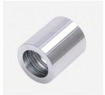
P/N:00210 Ferrule for sae 100r2at/din 20022 2sn hose