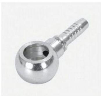
P/N:70011 Metric banjo