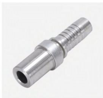
P/N:50011 Metric standpipe straight