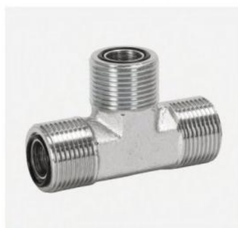
P/N:AF ORFS male O-ring tee