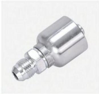
P/N:16711RW JIC male one piece