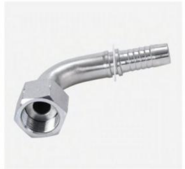
P/N:24291 90°ORFS female flat seat