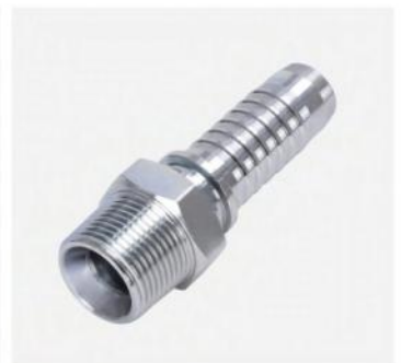
P/N:15611 NPT male