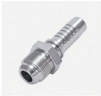
P/N:18611 JIS metric male 60° cone seal