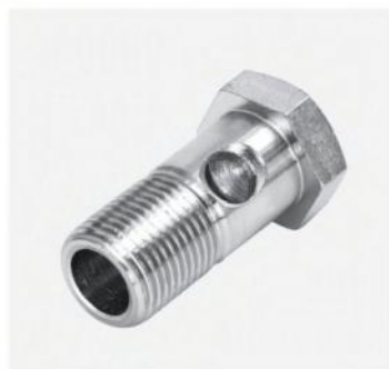
P/N:720B BSP bolt