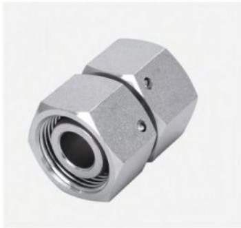
P/N:3C Straight tube adapter with swivel nut