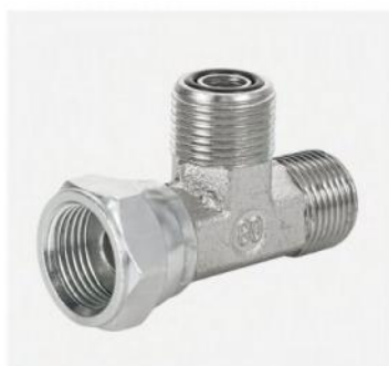
P/N:CF ORFS male o-ring/ORFS female run tee