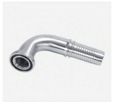
P/N:87391/87691 90°Sae flange 3000psi/6000psi