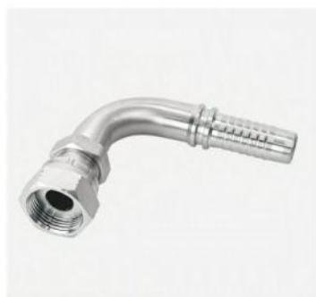
P/N:24291D 90° ORFS female flat seat double hexagon