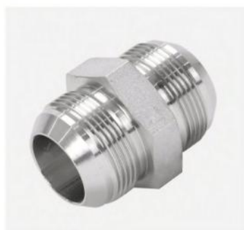
P/N:1J JIC male 74° cone