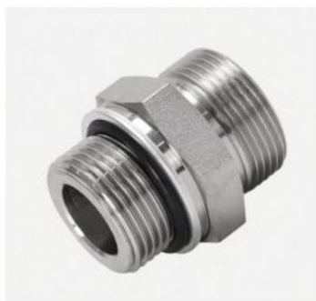
P/N:1FG ORFS male O-ring/BSP male O-ring