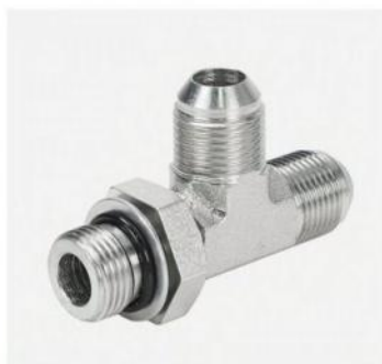
P/N:AJJO-OG JIC male 74°cone/sae o-ring run tee