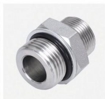
P/N:1CO UN.UNF THREAD thread stud ends with o-ring sealing