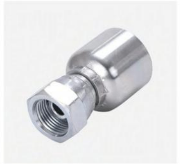
P/N:22611RW BSP female 60° cone one piece