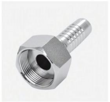
P/N:20211 Metric female flat seat