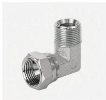
P/N:2NJ9 90° NPT male / JIC female 74° seat