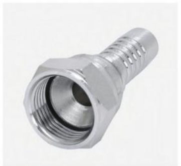
P/N:26711 JIC female 74° cone seat sae