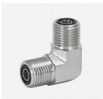
P/N:1F9 90°ORFS male o-ring