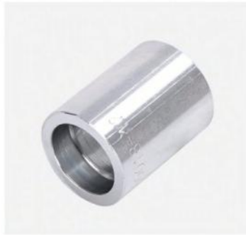
P/N:00018 Ferrule for sae 100r7 hose