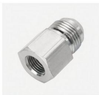
P/N:5J JIC male/JIC female