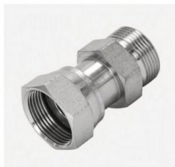
P/N:2F ORFS male O-ring/ORFS female