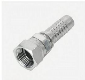
P/N:22611D BSP female 60° double hexagon