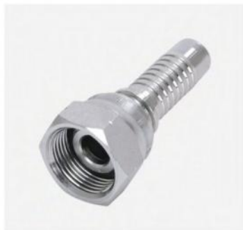
P/N:22611 BSP female 60° cone