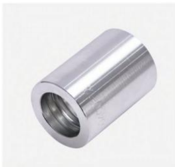
P/N:00400 Ferrule for 4sp,4sh/10-16,r12/06-16 hose