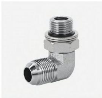
P/N:1JG9-OG 90°elbow JIC male 74°cone /sae o-ring boss I-series