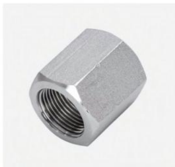
P/N:7N NPT female