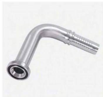
P/N:87391L/87691L 90°Sae flange 3000psi/6000psi long drop