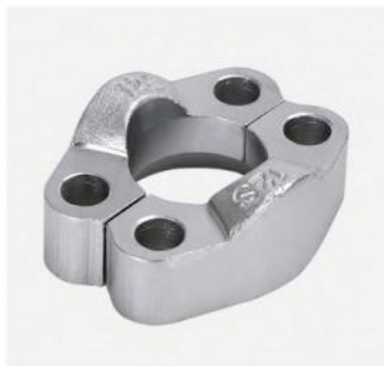
P/N:FL/FS Sae split flange clamps 3000psi/ 6000psi