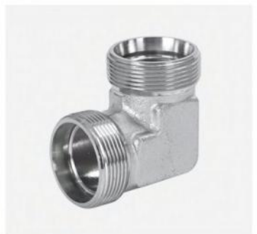
P/N:1C9 90°metric male 24°cone l.t