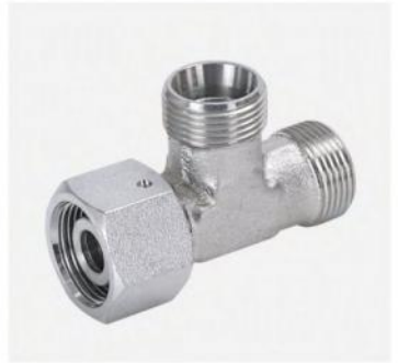
P/N:CC Run tee fittings with swivel nut