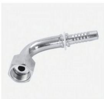
P/N:20291 90°metric female flat seat