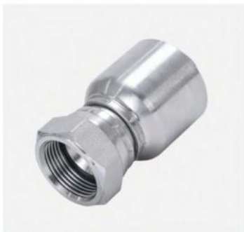
P/N:26711RW JIC female 74° cone seat sae one piece