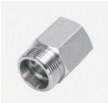
P/N:5CB Metric male thread /BSP female nut