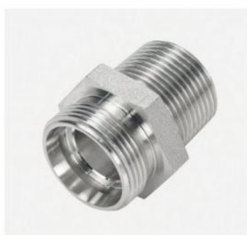
P/N:1CT BSPT male /metric male 24° cone I.t