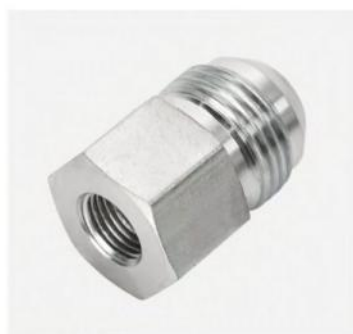
P/N:5JT JIC male 74° cone/BSPT female