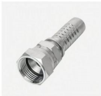
P/N:26711D JIC female 74° double hexagon