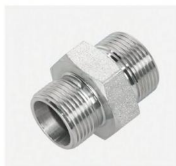
P/N:1C(REDUCERS) Straight reducers