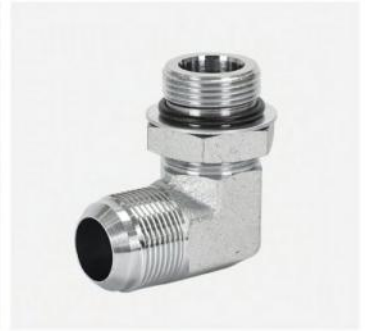
P/N:1JO9 90°elbow JIC male 74°cone /sae o-ring