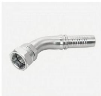
P/N:26741D 45° JIC female 74° double hexagon