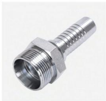
P/N:10411/10511 Metric male 24° cone seat L.T/H.T