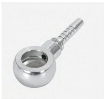
P/N:72011 BSP banjo