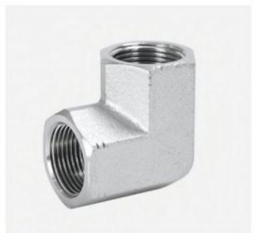
P/N:7N9 90° NPT female