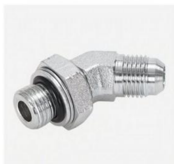
P/N:1JG4 45° elbow JIC male 74° cone /BSP male o-ring