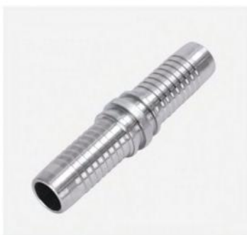
P/N:90011 Double connector