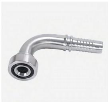
P/N:87991 Sae flange 9000psi