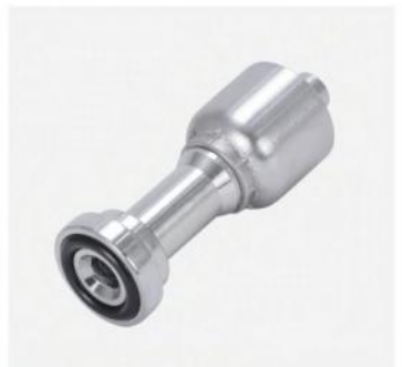
P/N:87311/87611RW Sae flange 3000psi/6000psi one piece