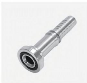
P/N:87311/87611 Sae flange 3000psi/6000psi