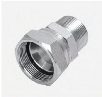
P/N:2NJ NPT male / JIC female 74° seat