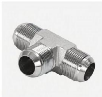
P/N:AJ JIC male 74° cone tee