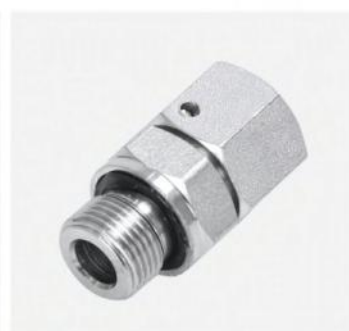
P/N:2GC BSP thread stud ends with o-ring sealing /metric female 24° cone o-ring sealing