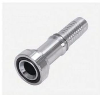
P/N:87911 Sae flange 9000psi