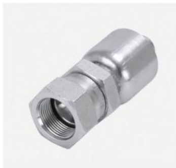
P/N:26711DRW JIC 74° cone seat sae double hexagon one piece