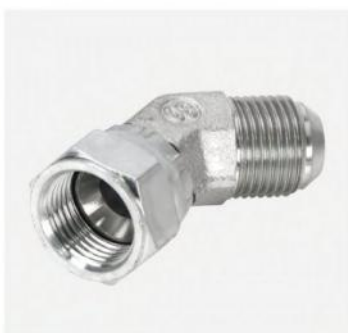
P/N:2J4 45° JIC female 74° cone/JIC male 74° cone