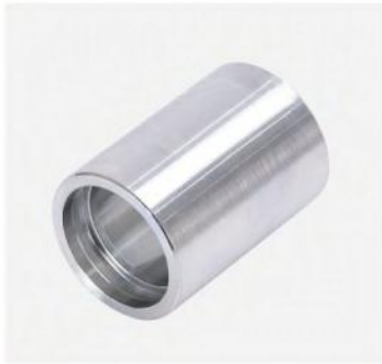
P/N:00TF0 Ferrule for teflon hose