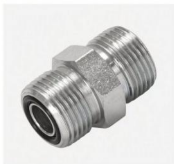
P/N:1F ORFS male O-ring