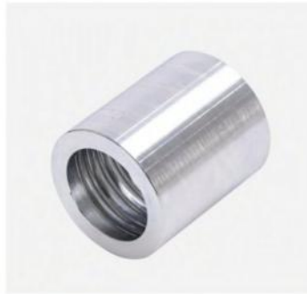
P/N:00110 Ferrule for sae 100r1at/en853 1sn hose