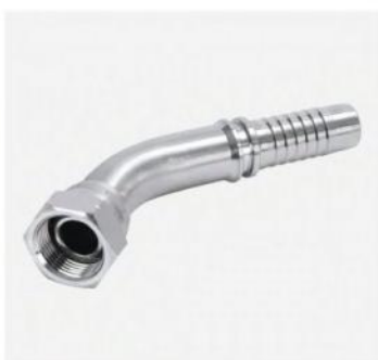
P/N:22641 45°BSP female 60°cone