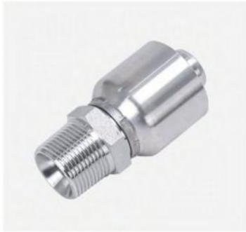
P/N:15611RW NPT male one piece