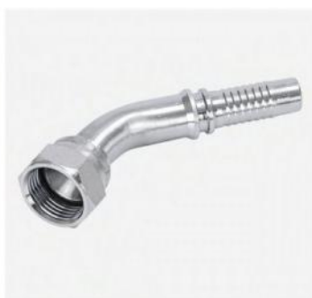
P/N:26741 45°JIC female 74° cone seat sae