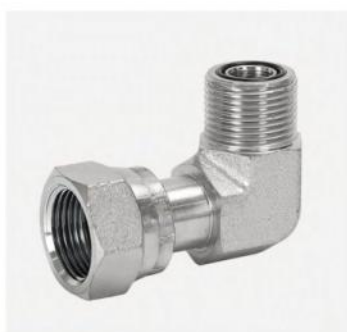
P/N:2F9 90°ORFS male o-ring/ORFS female