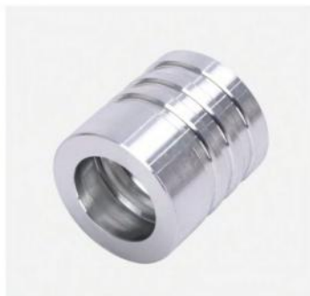
P/N:00402 Sae r12/4sh ferrule (manuli m00900/10/20)