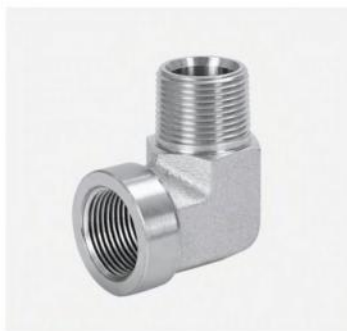
P/N:5N9 90° NPT male / NPT female