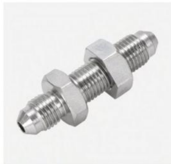
P/N:6J-LN JIC female 74° cone bulkhead