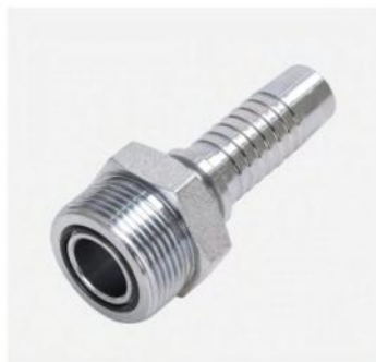
P/N:14211 ORFS male o-ring seal