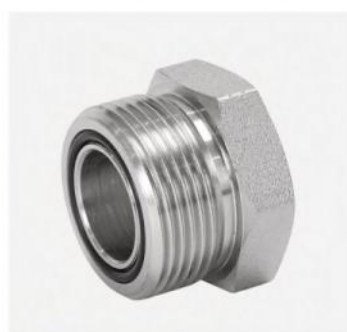
P/N:4F ORFS male O-ring plug