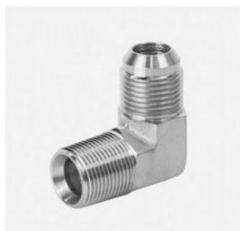
P/N:1JT9 90° elbow JIC male 74° cone/BSPT male