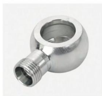
P/N:1CI Metric banjo tube fitting