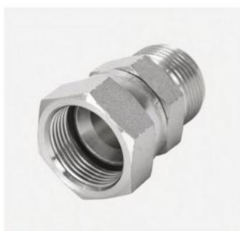
P/N:2J JIC female 74° cone/JIC male 74° cone