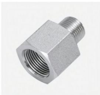
P/N:5N NPT male / NPT female