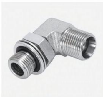
P/N:1CH9-OG 90°metric thread adjustable stud ends