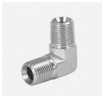
P/N:1N9 90° NPT male