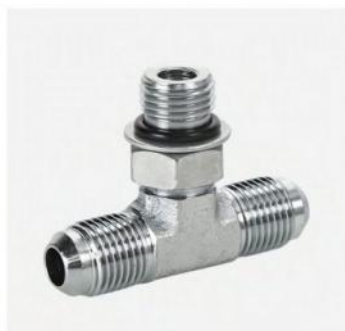
P/N:AJOJ-OG JIC male 74° cone/sae o-ring run tee