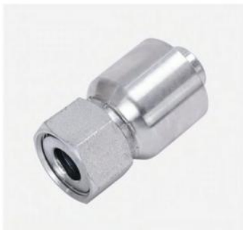
P/N:34211RW 90°ORFS female flat seat one piece