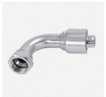
P/N:26791RW 90°JIC female 74° cone seat sae one piece