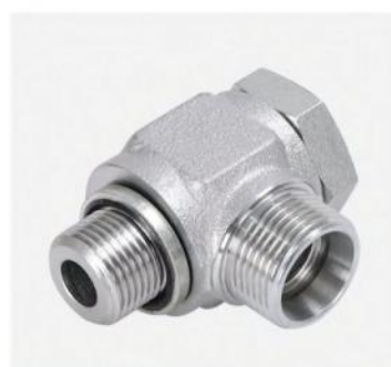
P/N:1CI(PARKER) Metric banjo tube fitting