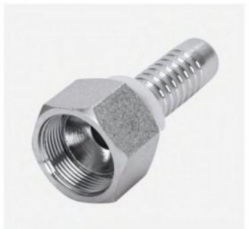
P/N:20711 Metric female 74° cone seat