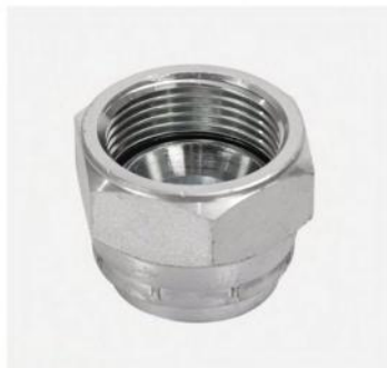
P/N:9J JIC female 74°seat plug