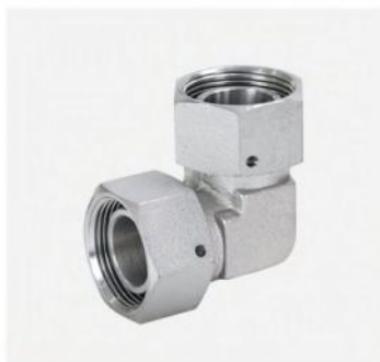
P/N:3C9 90°straight tube adapter with swivel nut