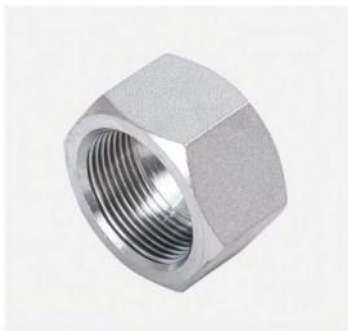
P/N:NL/NS Retaining nuts