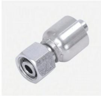
P/N:20411/20511RW Metric female 24° cone o-ring L.T/H.T one piece