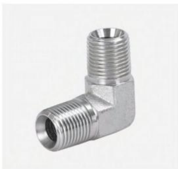
P/N:1T9 90° BSPT male