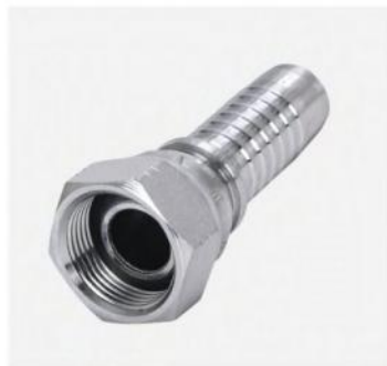
P/N:21611 NPSM female 60° cone sae