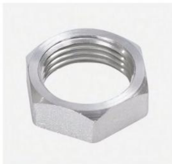
P/N:8C Metric lock nut