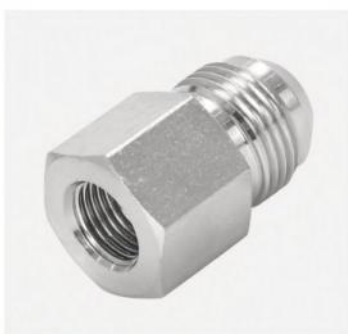
P/N:5JN JIC male 74°/NPT female