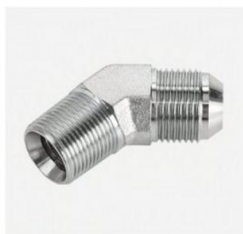
P/N:1JT4 45° elbow JIC male 74° cone/BSPT male