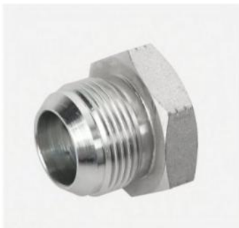
P/N:4J JIC male 74°cone plug