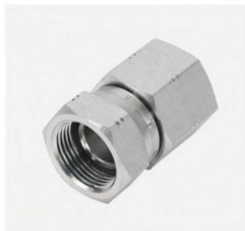
P/N:3NU NPT female / NPSM female 60° cone