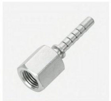
P/N:15611N NPT female