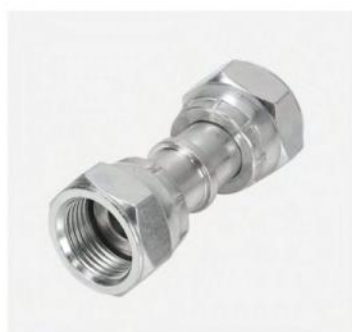
P/N:3F ORFS female