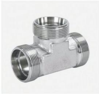
P/N:AC Metric male 24° cone I.t. equal tees