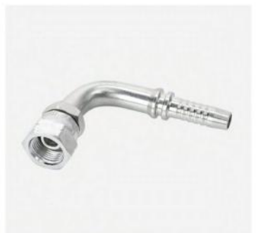
P/N:22691D 90° BSP female 60° double hexagon