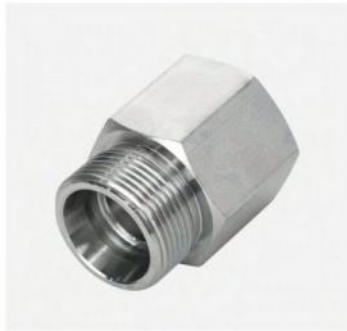
P/N:5CM Metric male thread /metric female nut