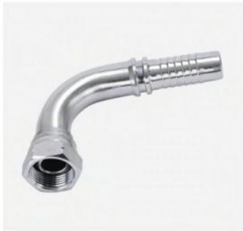
P/N:22691 90°BSP female 60°cone