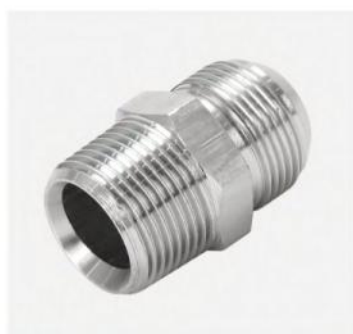
P/N:1JN JIC male 74°/NPT male