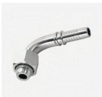
P/N:20491C 90°metric female 24° cone without o-ring L.T