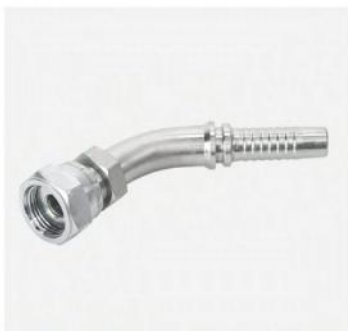
P/N:24241D 45° ORFS female flat seat double hexagon