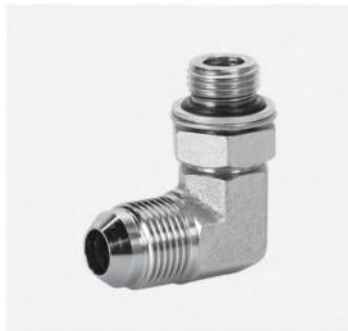
P/N:1JH9-OG 90°elbow JIC male 74°cone /metric adjustable stud end I-series