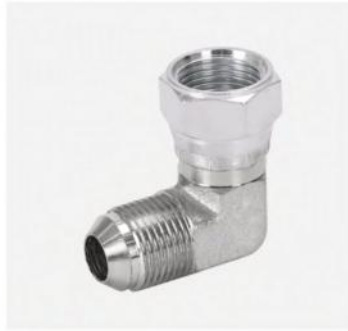
P/N:2J9 90°JIC female 74° cone/JIC male 74° cone