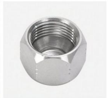
P/N:9J-CAP JIC female plug