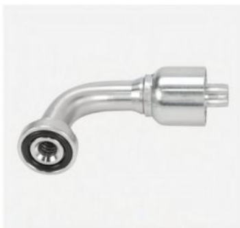
P/N:87391/87691RW 90°sae flange 3000psi/6000psi one piece