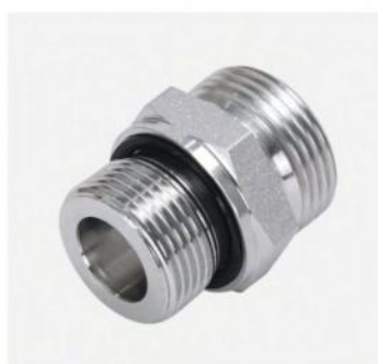
P/N:1CH Metric thread stud ends