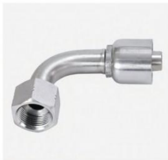
P/N:24291RW 90°ORFS female flat seat one piece