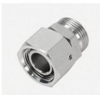
P/N:2C Reducer tube adapter with swivel nut