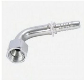
P/N:20791 90°metric female 74° cone seat