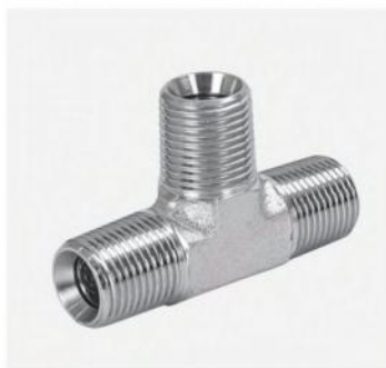
P/N:AN NPT male tee