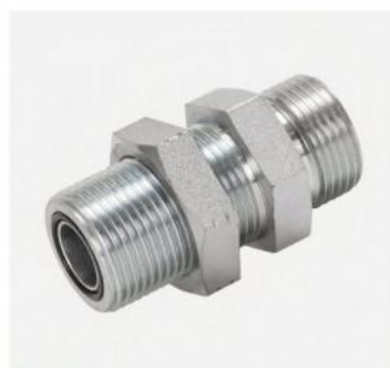
P/N:6F ORFS male O-ring bulkhead