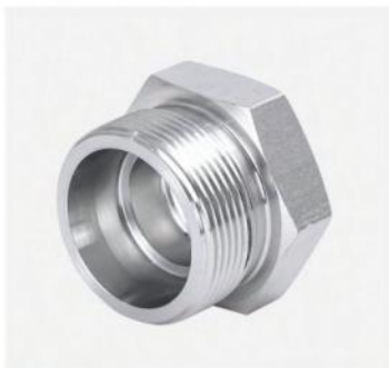
P/N:4C Metric male thread plug